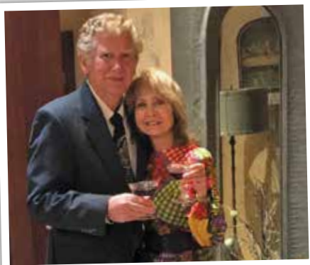
50th Wedding Anniversary